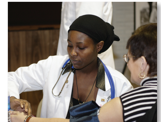
Helping Hands for Healthy Hearts

Expanding Our Commitment to the Community