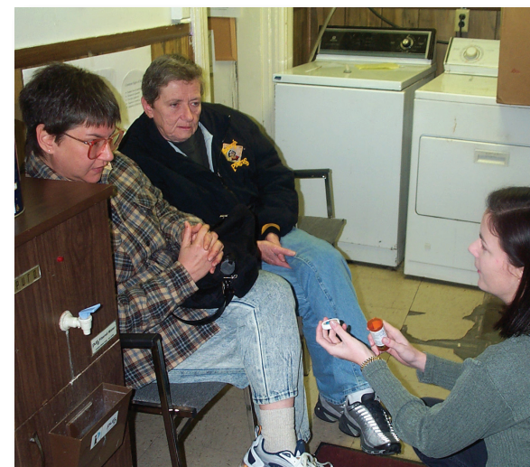
Program for the Underserved