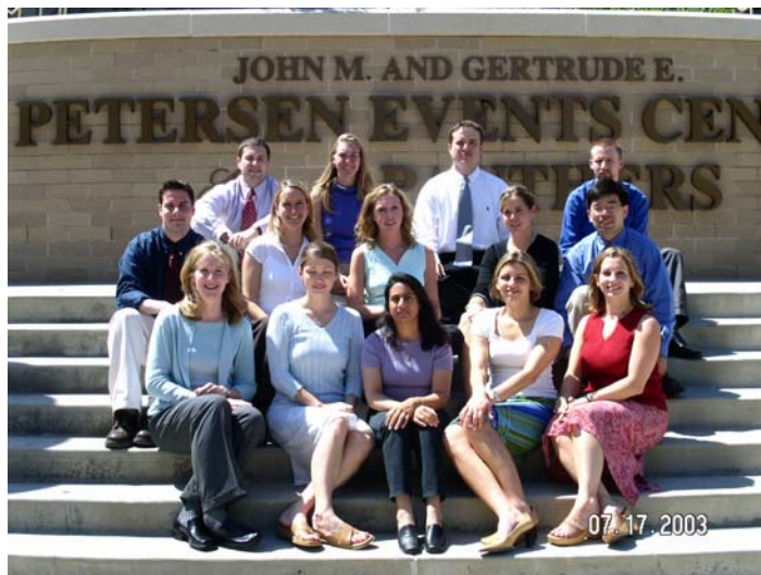
Residents at the Petersen Center

pating in regular Research Group meetings to help with the development and progress of our research projects. Various faculty members attend and assist us in the design of study aims and objectives, design of data collection sets, etc. . This is a great way to keep us on track with our research projects and help us get ready to pre-