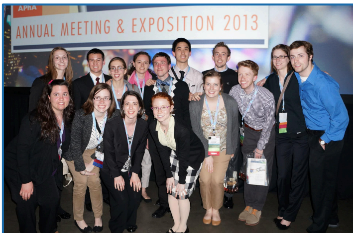
KY brothers pose for a picture after the closing ceremony at the APHA-Annual meeting in Los Angeles, CA.