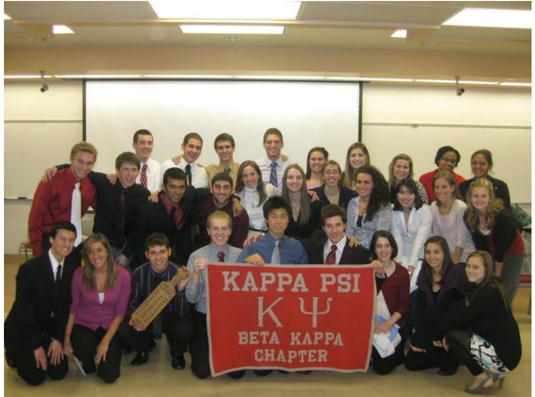
The New Kappa Psi Brothers in Salk Hall after initiation in December.

As the Kappa Psi Brothers begin to get into the swing of the new semester, they will elect the new executive committee to serve throughout the rest of