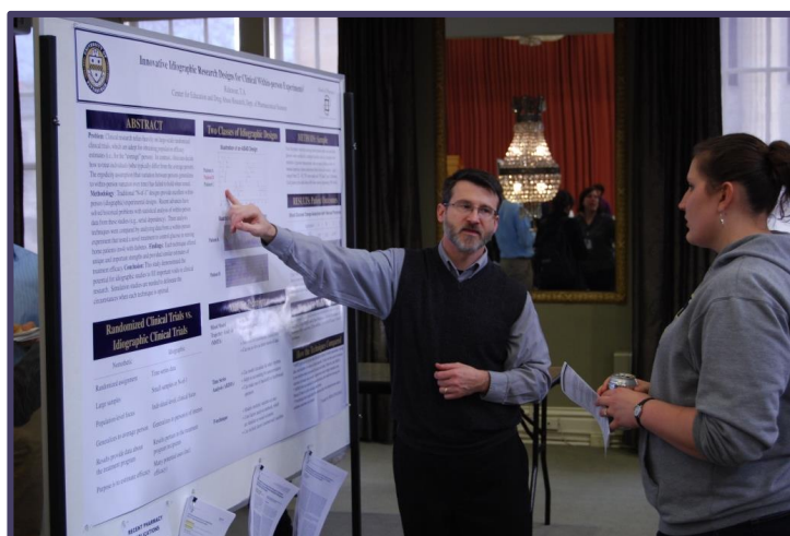
School faculty present their research projects to students, residents and fellow faculty on Thursday, January 31st at the O'Hara Student Center as part of Rho Chi's "Posters, Professors and Progress" event.