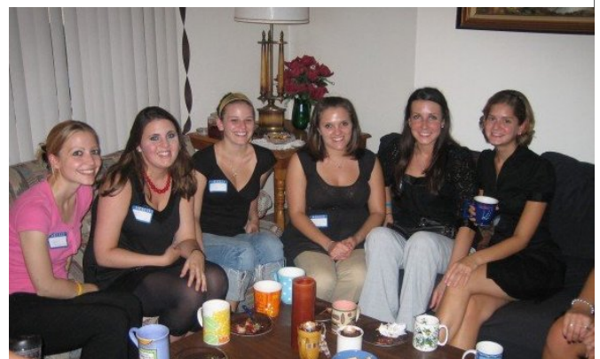
Above & to the right: LKS girls at last year's recruitment events.