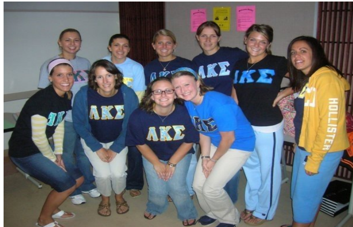
From all of us at LKS, welcome to the fall semester!

"Today, LKS claims over 22,000 members internationally, with 44 campus chapters and 36 alumni chapters."