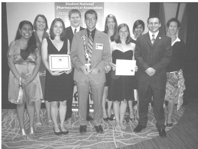
Pitt students representing our SNPhA chapter in Chicago 7/17 to 7/20