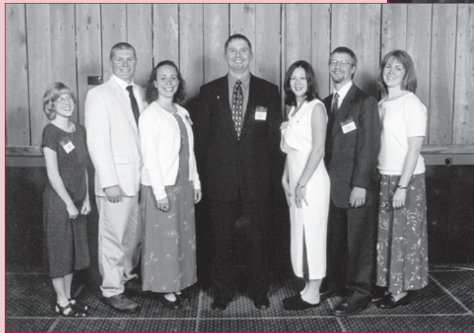
Thanks go out to School of Pharmacy students who helped in many ways during the weekend.