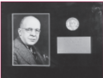
Snapshot from Pharmacy's Past page 3