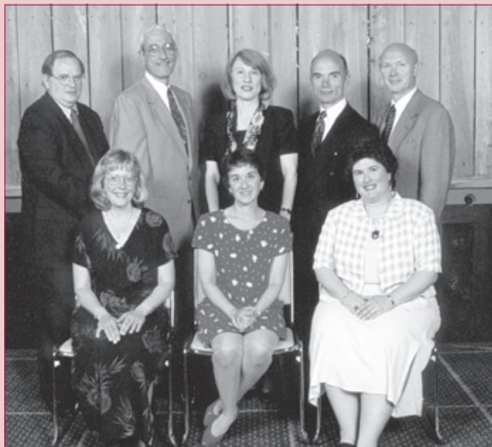
Class of 1975 celebrating their 25th reunion.

On-line registration for 2001 Alumni Weekend will be available on the web site in future months and announcements regarding the weekend are soon to be posted. See you in June!