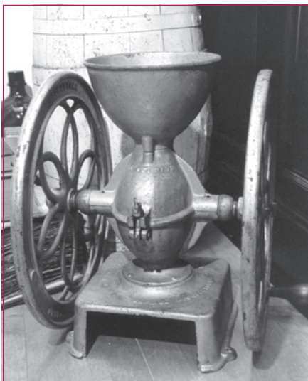
The Enterprise Drug Mill.