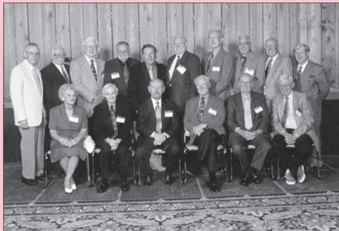
A good showing for their 50th. The Class of 1950 had their largest-ever class reunion for Alumni Weekend.