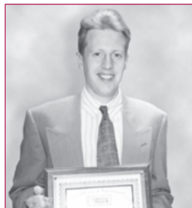
Mentoring at Its Best page 8