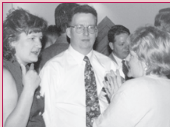
Good times with good friends.