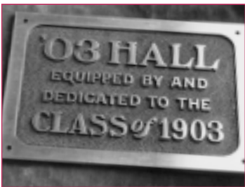
Snapshot from Pharmacy's Past page 4