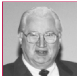
A Virtual Garden page 9