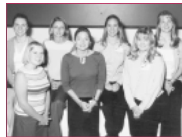
Bridging the Gaps page 10