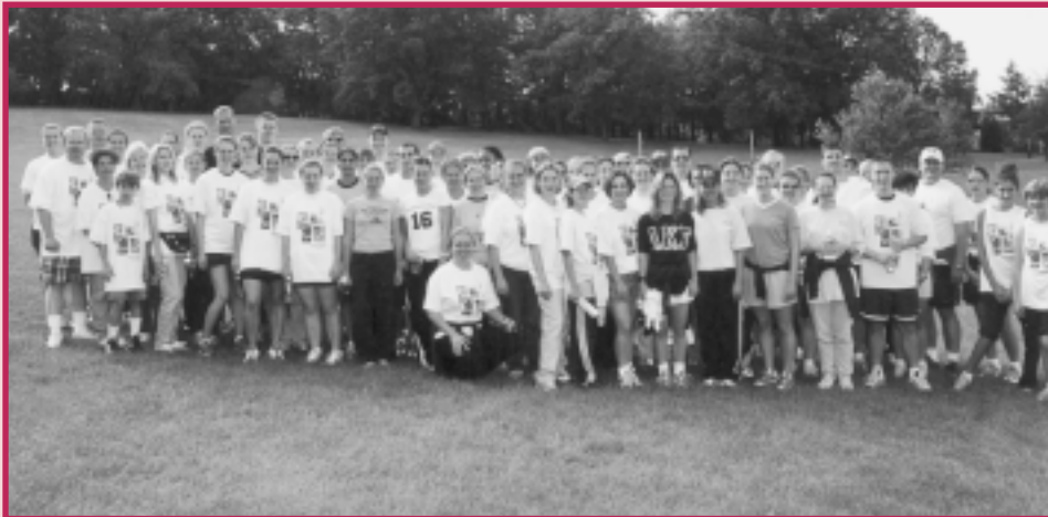
Walk to Cure Diabetes