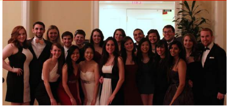
KY fall pledge class 2013 poses at the annual spring formal

Some of our traditions and activities include going to Scarehouse, a lineage dinner at Spaghetti Warehouse, and a Secret Santa gift exchange at our Christmas Party during the fall semester. In the spring semester, we head off to our annual ski trip at the Wisp Ski Resort in Deep Creek, Maryland, cook out for a Pittsburgh Pirates tailgate, hold a spring formal, and celebrate our P4s' graduation.