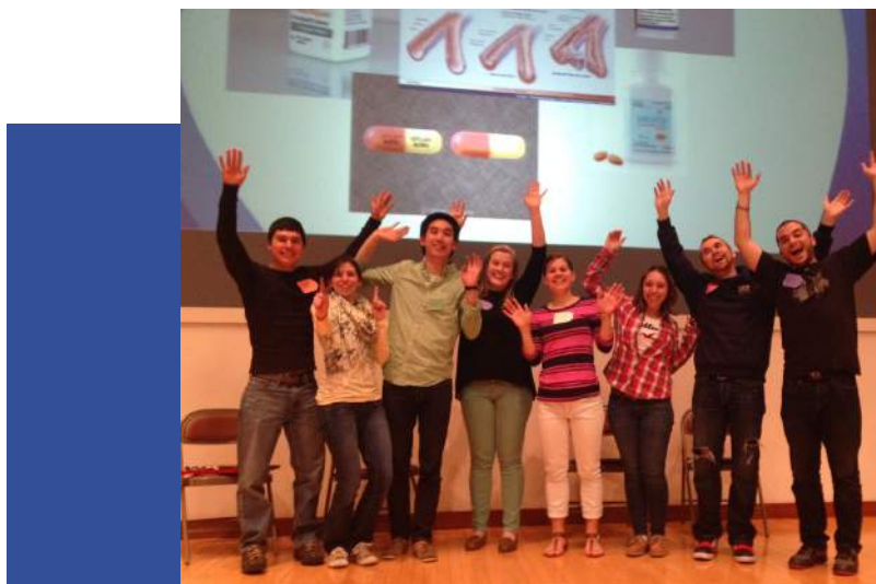
This past year we held our First Annual Pharmacy School Spelling Bee, in which students competed to spell drug names and medical terms correctly for a trophy and prize.

Not only does the committee work towards planning these staple events, but we are constantly brainstorming and planning ideas for new events as well.