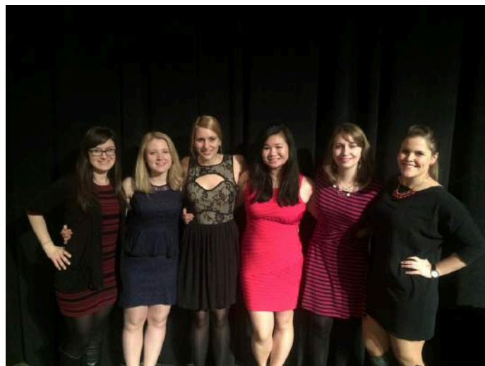
Brothers at the banquet dinner Saturday night at the province meeting in Nashville

Since our last update, Beta Kappa had the pleasure of initiating 30 new brothers! FPC 2014 was very excited to finally join the brotherhood and receive their nicknames and letters. We were also very excited to join grad brothers at the Pitt Grad Holiday Party last month. Hilarious gifts were exchanged and everyone bought something delicious to the potluck; a good time was had by all!