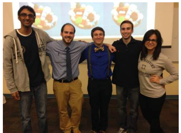
Rho Chi members giving Top Drugs

Welcome back to another great semester! Rho Chi members finished out last semester with many events so here’s a recap! In November, Rho Chi held the annual Posters, Professors and Progress event. This event featured faculty and their research and students were able to rotate through the tables that interested them the most. The event was a success and we hope that everyone who attended enjoyed it as much as we did!