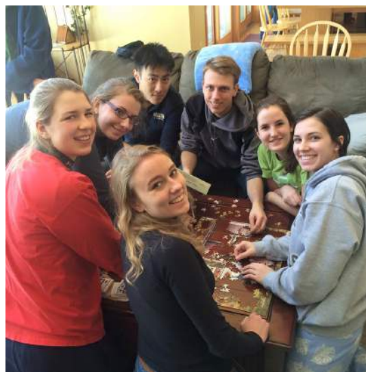
Brothers putting together a puzzle and bonding at Ski Trip

The weekend after New Year's, six brothers traveled to Nashville for the Gulf Coast Province meeting hosted by the Epsilon Lambda chapter, which is Lipscomb University! We had a wonderful time exploring Nashville and getting to know brothers from that province as well as brothers from the Mountain East, Great Lakes, and Southeast provinces! The first weekend of the semester, over 60 brothers journeyed to Deep Creek, Maryland for our annual ski trip. Brothers made good use of the sauna and the hot tubs in the cabin and bonded over movies, board games, and conversations at all hours of the night.