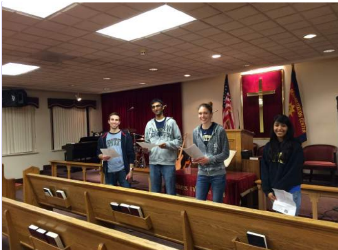
Left: Rho Chi members giving health talk at Salvation Army Rehabilitation Center