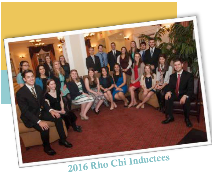
2016 Rho Chi Inductees

Over the summer, Rho Chi members have been busy preparing for the upcoming year's events. This school year we are looking forward to continuing our previous projects and events as well as developing new ones. Rho Chi partners with PLS to host a monthly lecture series during lunch that features a distinguished guest in the field of pharmacy. Stay tuned for emails of who the guest speaker of the month will be; you won't want to miss it! Other events run by Rho Chi include a blood drive during the fall and the spring, which is usually associated with a prize. Rho Chi also runs a lab card fundraiser as well as opportunities to learn about faculty and student research projects.