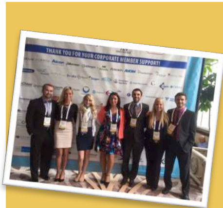
Pitt students attended the AMCP Nexus 2015 Conference in Orlando, FL

In addition to happenings at the local chapter level, this summer several of our members attended the 2016 SNPhA National Convention, which was held in the city of Atlanta, GA. There, we were able to touch base with other fellow SNPhA members, as well as present