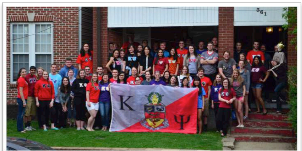
Brothers outside of the Kappa Psi house

On behalf of everyone in Kappa Psi, I'd like to welcome the P1 class to Pitt. Have a great year, study hard (but not too hard), and get involved in student organizations! Kappa Psi is an organization for pharmacy students and pharmacists who dedicate themselves to advancing the profession of pharmacy educationally, fraternally, and socially. We form strong networks of friendship and association based on our bonds of Brotherhood, and we hold ourselves to high standards. Kappa Psi is the largest pharmacy fraternity in the world with over