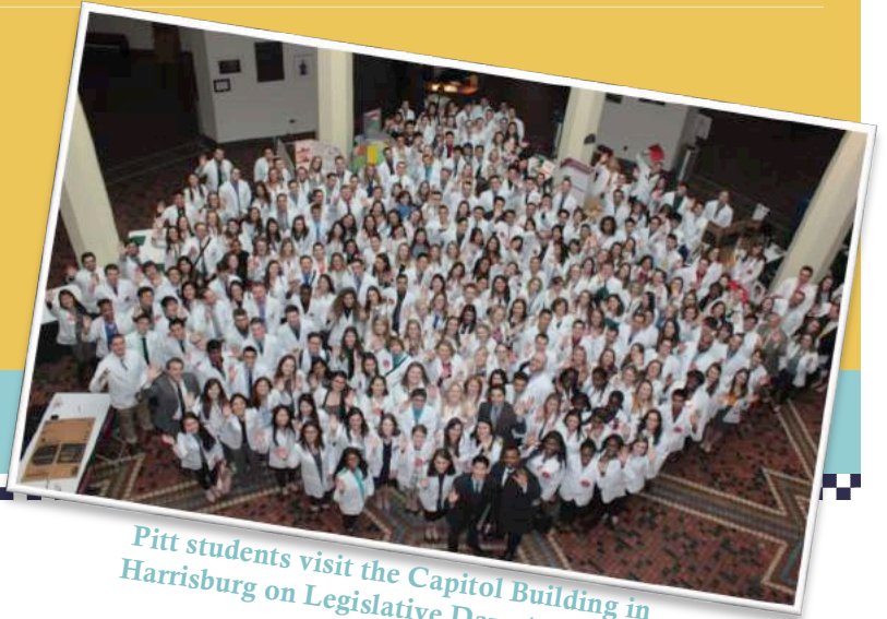
Pitt students visit the Capitol Building in Harrisburg on Legislative Day, April 2016