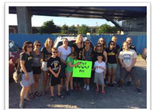
2016 PLS Pirates Game

After a busy year, PLS members enjoy a Pittsburgh Pirates baseball game during the summer, a yearly tradition that brought together three faculty members and six PLS members this past July. We look forward to meeting the new class of pharmacy students at the Annual Back-To-School Picnic and at our PLS events throughout the year!