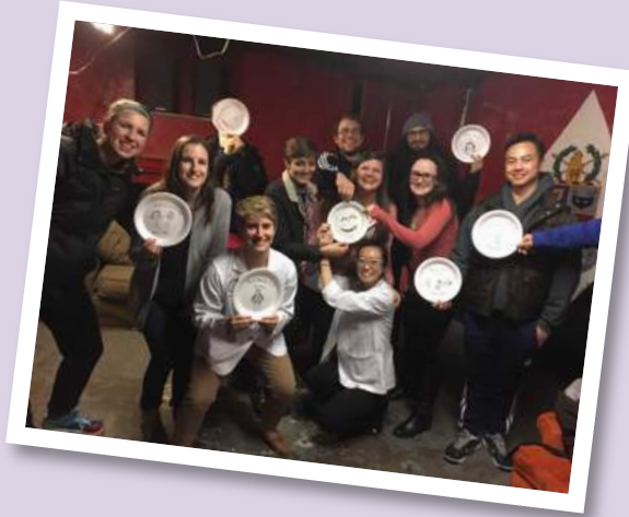
Winners of the awards from Black and White

We also have plenty of philanthropy events coming up for this semester. We have a team participating in Relay for Life on April 1 st to raise awareness and money for the American Cancer Society. Additionally, we will be volunteering with global links to help sort medical supplies to send to areas in need as well as with Family House to cook dinner and socialize with the families staying there.