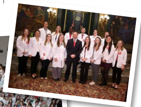
Legislative Day 2016