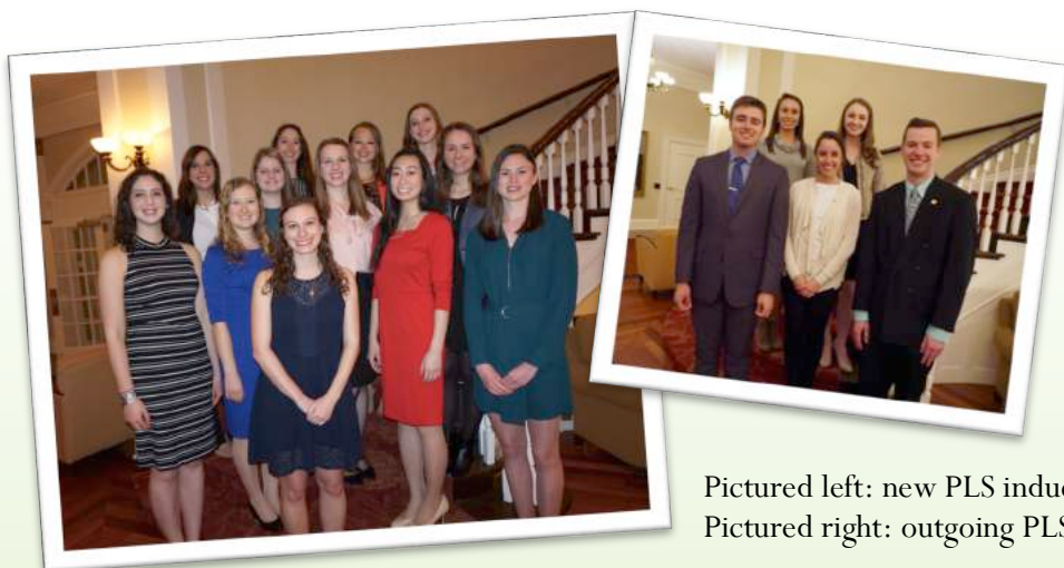
Pictured left: new PLS inductees Pictured right: outgoing PLS officers